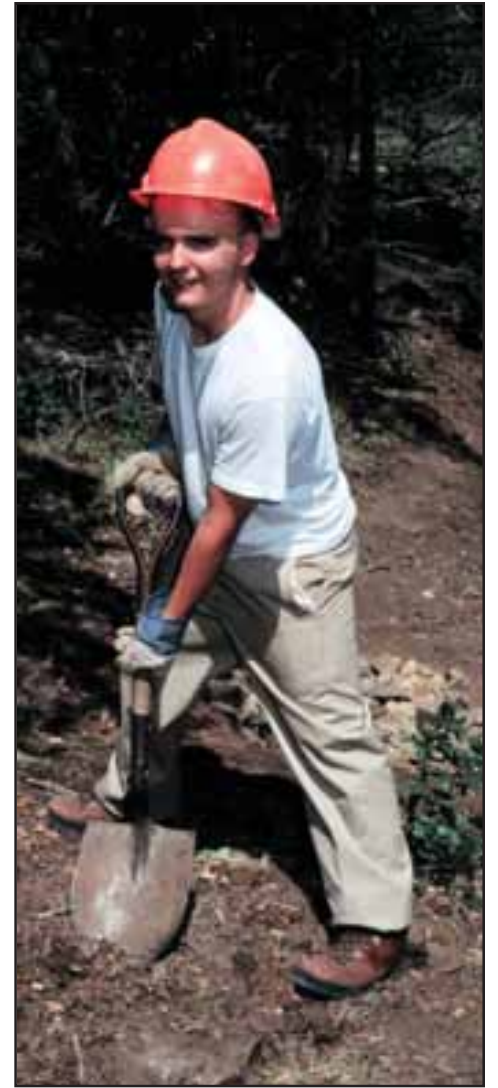
(Above) An Arrowman works hard building a trail with his OA Trail Crew. (Left) The Tooth of Time looks over the Philmont backcountry.

There are still spaces available for 2005, so go to the OA Web site and download your application. 🏹