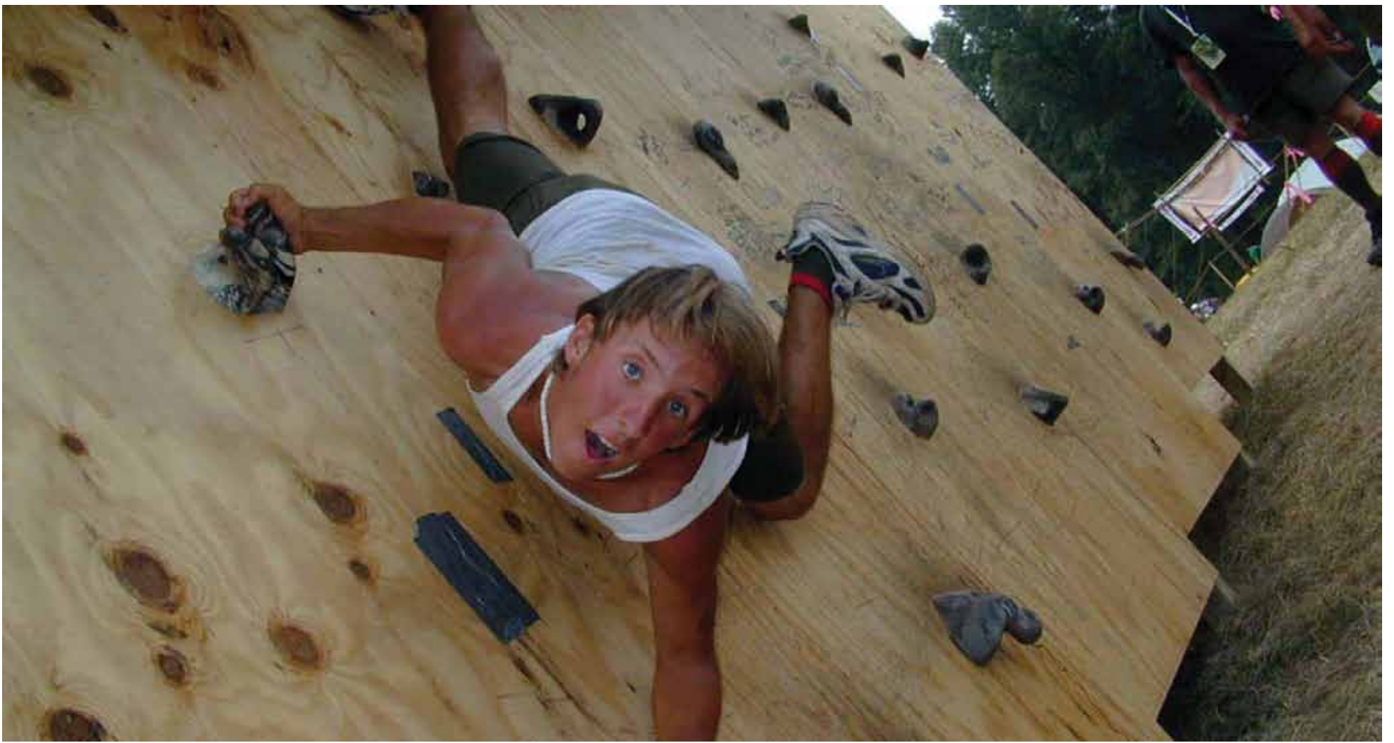
"The Outdoor Adventure Place" (also known as TOAP) features many exciting activities such as this rock climbing wall.