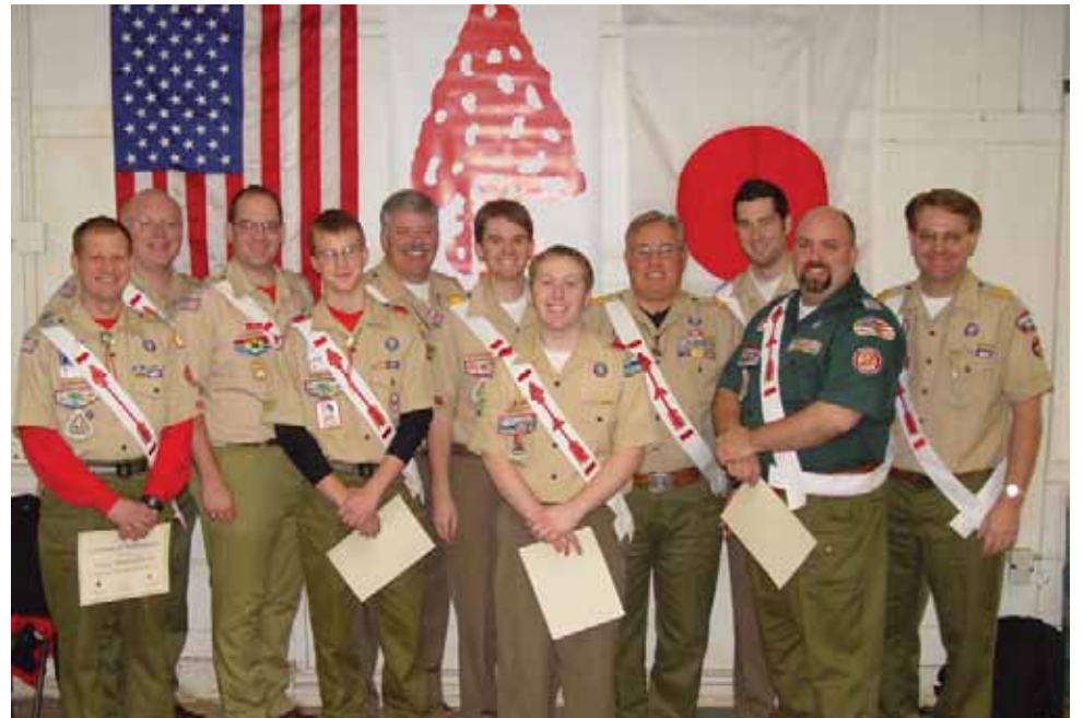
This NLS near Tokyo was the first seminar held outside US territories.