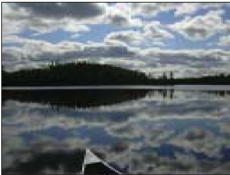
On an OA Wilderness Voyage, Arrowmen will experience spectacular sights in a pristine wilderness.

With 126 spots available for summer 2005, OA Voyage is primed once again to