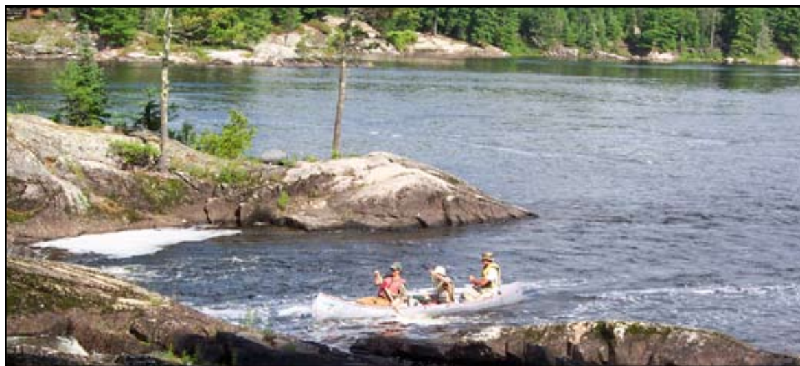
The Order of the Arrow Canadian Odyssey

Application forms are available at www.adventure.oa-bsa.org .