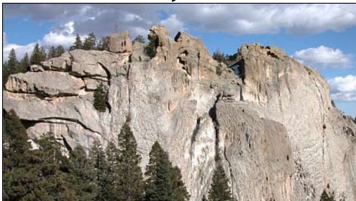
Philmont Scout Reservation