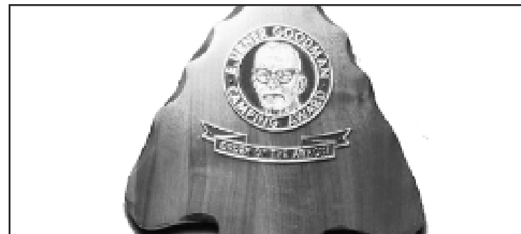
E. Urner Goodman Camping Award presented to lodges each year .

The Goodman Camping Award was named in honor of our founder, who created our great organization with the purpose of promoting Scout camping. Currently, eight lodges receive the award annually in recognition of their outstanding