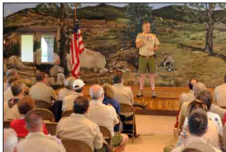
Training center participants listen in on one of the training sessions.

The 2012 Philmont OA Adviser Conference is open to all OA lodge, chapter, and committee advisers. To register, visit www.myscouting.org and click on Event Registration. For additional information on the conference, visit http://oa-bsa.org/programs/ptc .