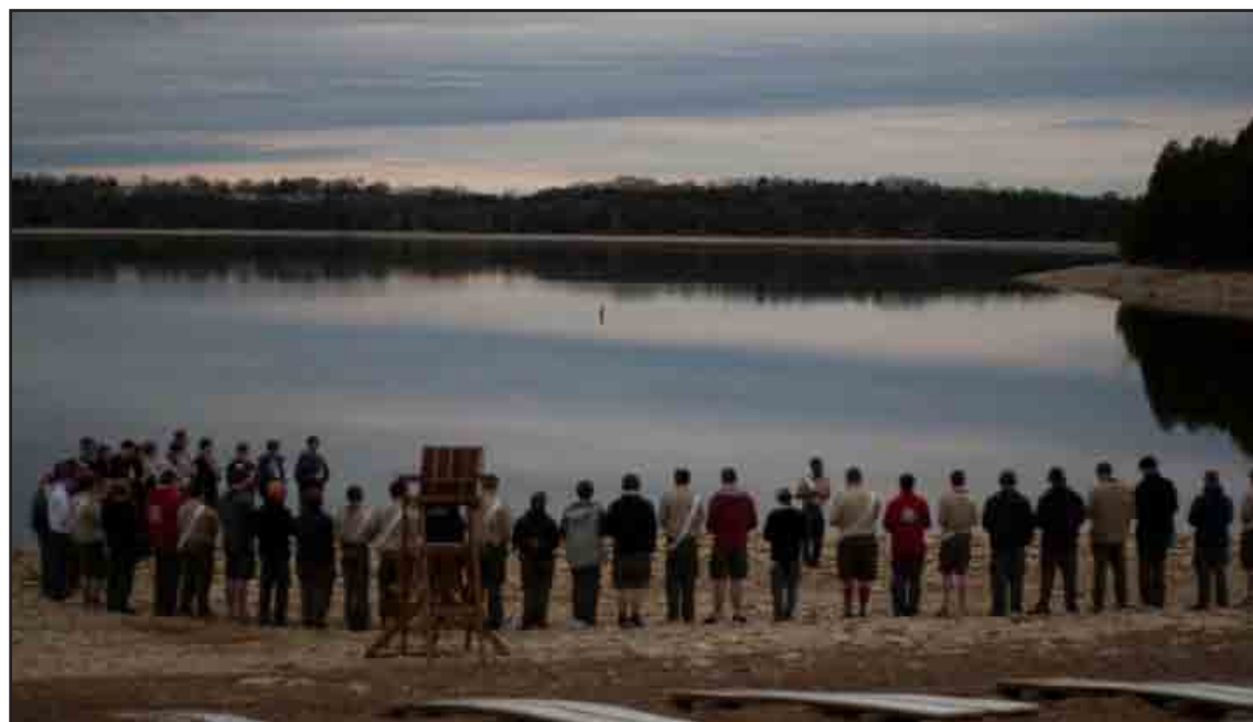
Arrowmen gather at the Lake at Camp Widjiwagan for a session during NLS in Nashville, TN.

Scouts and Scouters take home leadership skills and resources to better the programs they are involved in. Do not miss the opportunity to experience the National Leadership Seminar! Contact your lodge leadership or go to your region's website for the 2012 calendar of NLS events and register for the best training weekend ever! You do not want to miss it!