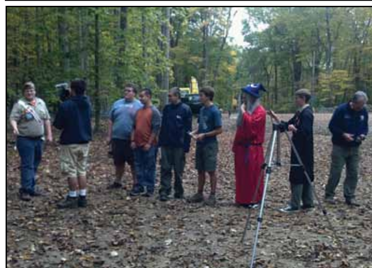
Arrowmen in Owaneco Lodge work together as a team to put together their latest film to show.