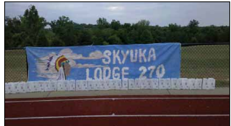
Skyuka Lodge representing their lodge at local Relay for Life.