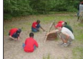
Calumet Council OA Scoutreach outing

The troop had met as a unit only once before the Scoutreach pilot program. Collectively they had little leadership or Scouting