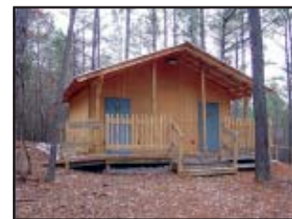
Completed bathroom constructed by the members of Alibamu Lodge, Tukabatchee Area Council