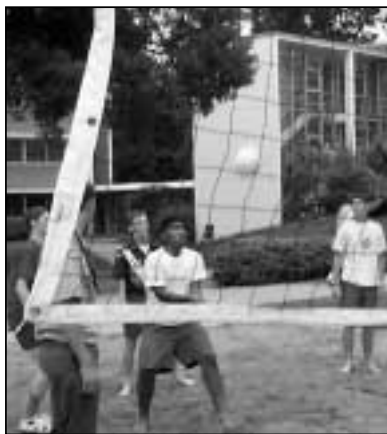
Arrowmen play volleyball after check-in.