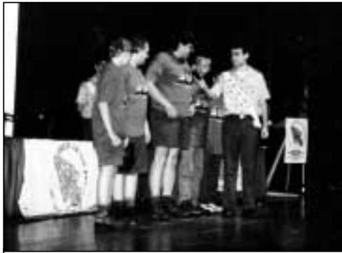
At the LLDC session, participants learned that one type of training, like a shirt, does not fit all.

The Lodge Leadership Development Course delivers nuts-and-bolts information on lodge administration and programs. The new format utilizes a CD-ROM program to evaluate the Key 3 and lodge leadership to accurately assess the lodge's training needs. The program then chooses from among 30 training sessions to develop a custom, prioritized training schedule for the lodge. In addition, the new course contains 12 advising guides and a comprehensive guide that helps the lodge plan an LLDC. 🏹