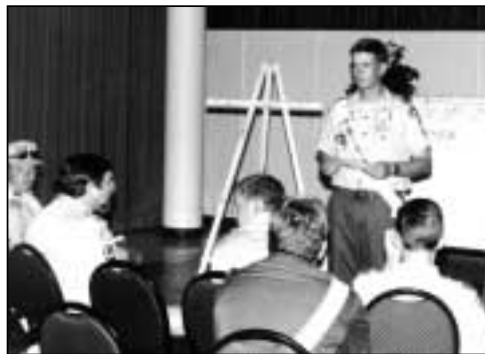
Informative, creative training sessions with group participation were the hallmark of the Summit.

A report will be given to the training subcommittee of the national OA committee, detailing participant views and ideas on how to develop future training sessions. 🏹