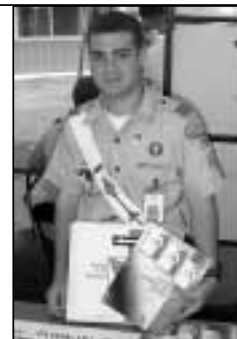
New OA ceremony books were displayed at the Summit.