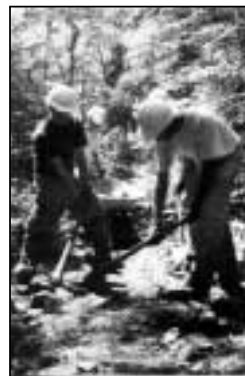
Arrowmen unselfishly serve by constructing portage trails at Charles L. Sommers High Adventure Base.

With a staff of 16, including 12 OA voyage foremen, the trail crews completed work on six portage trails and more than 12 campsites for a total of more than 5,000 hours of unselfishness service to the BWCA. Each OA voyage crew traveled more than 50 miles by canoe. Arrowmen received training in low-impact camping, wilderness etiquette, and high-adventure canoeing throughout their two-week session.