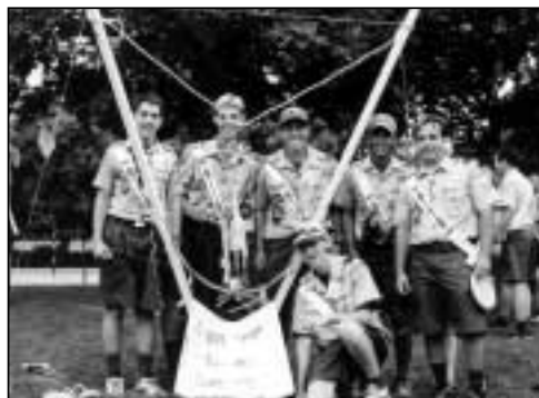
Total Outdoor Arrowman Development (TOAD) challenged Arrowmen in creative uses of a rubber chicken.