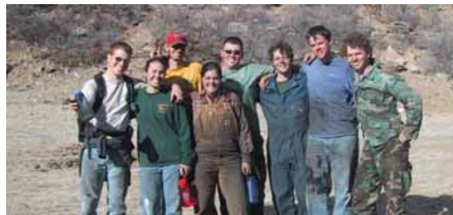
A Philbreak crew takes a break from cheerful service for a group picture.