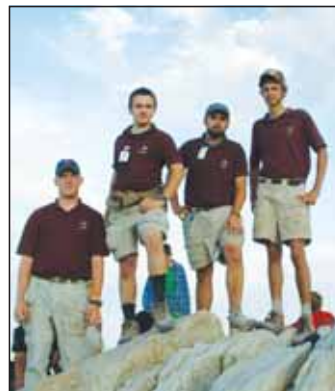
Talented Philmont staff members

Your crew will enjoy the freedom the Double H has to offer. While hiking across the ranch, your wilderness guide will provide programs along the way. You will experience black powder rifle shooting, geocaching, a challenge course, Leave No Trace training,