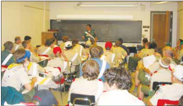
The new LLD will help improve the quality of training in every lodge.