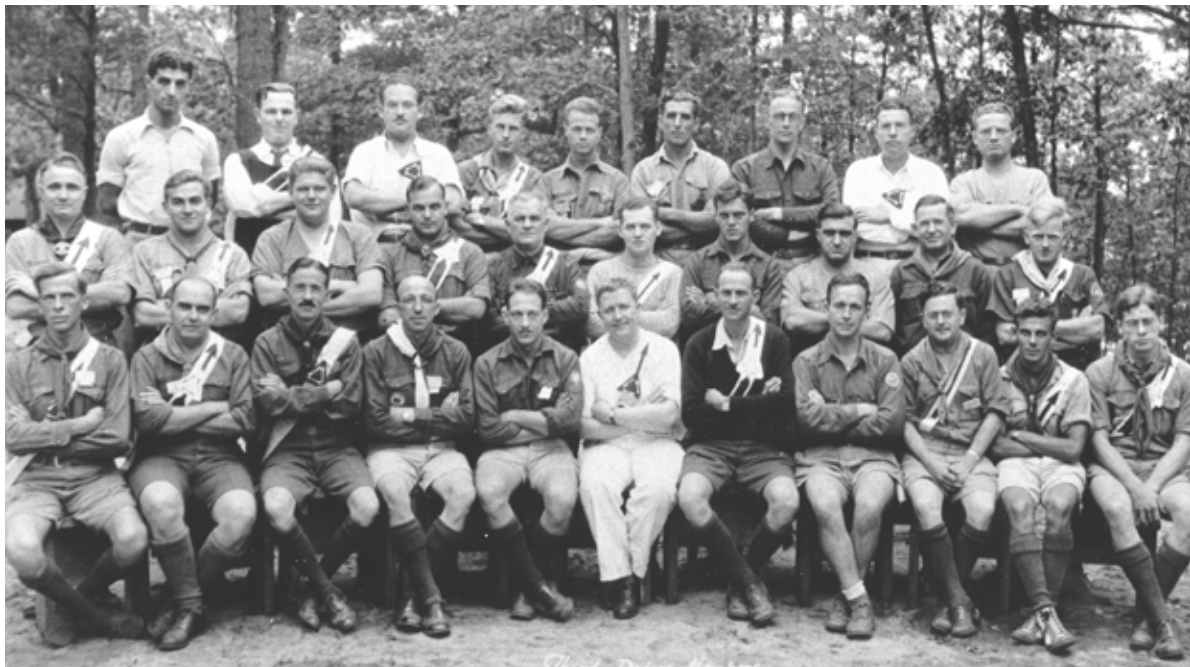
Third Degree members (Vigil Honor) at the 1933 Grand Lodge Meeting.