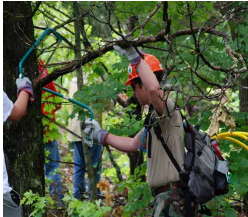
Arrowmen completing service projects as a part of ArrowCorps 5 in 2008 at five United States National Forests.