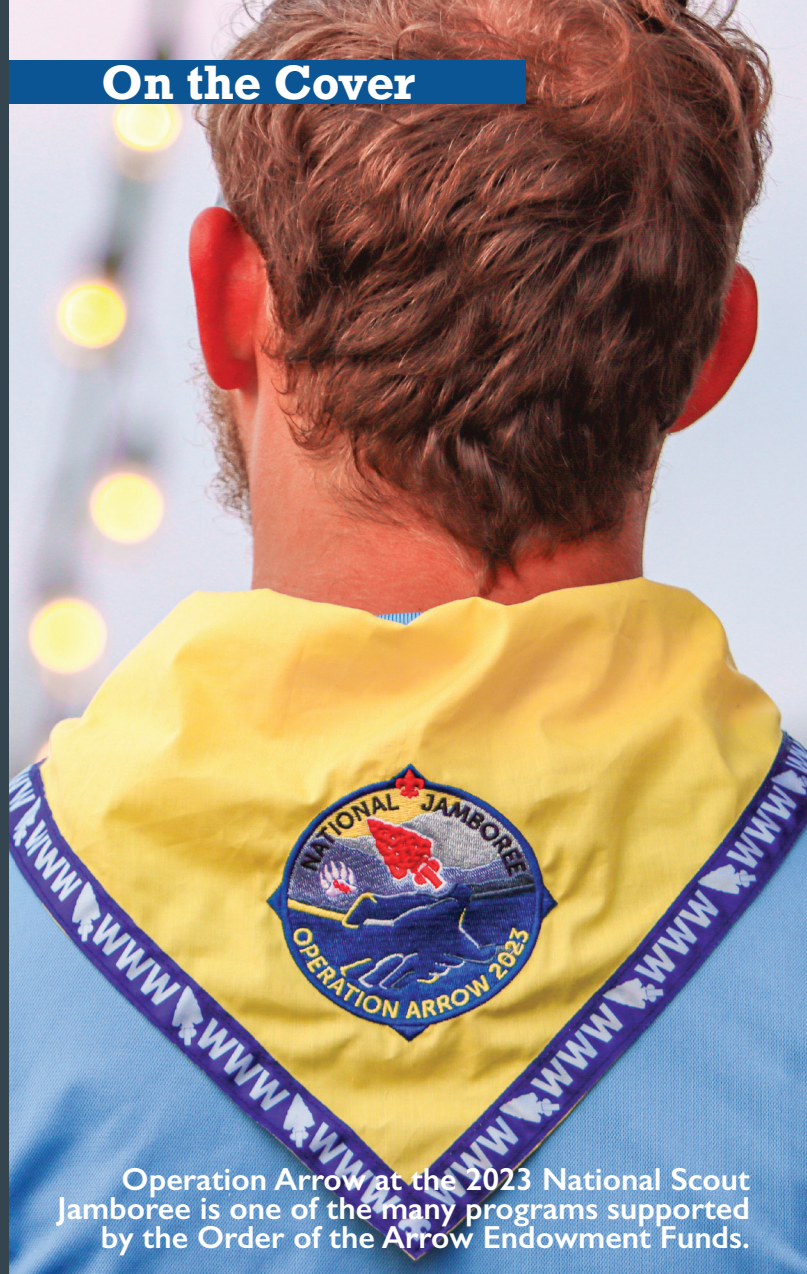
Operation Arrow at the 2023 National Scout Jamboree is one of the many programs supported by the Order of the Arrow Endowment Funds.

In recognition of the varied capacities and intentions of our donors, we have restructured our giving levels to better reflect your philanthropic goals and to enhance the recognition of your generosity. The new giving levels include: