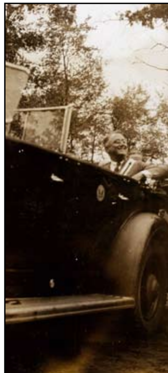
President FDR after his induction into the Order.

The OA History Timeline, an interactive Internet website, is scheduled to launch early Summer 2011. This image of President Roosevelt featured in this article was found by accident among postcards and other early photographs of TMR. The group preparing the OA History Timeline researched and uncovered the facts behind the photograph. This photograph is both iconic and demonstrative of the relationship of our Order and our nation's history.