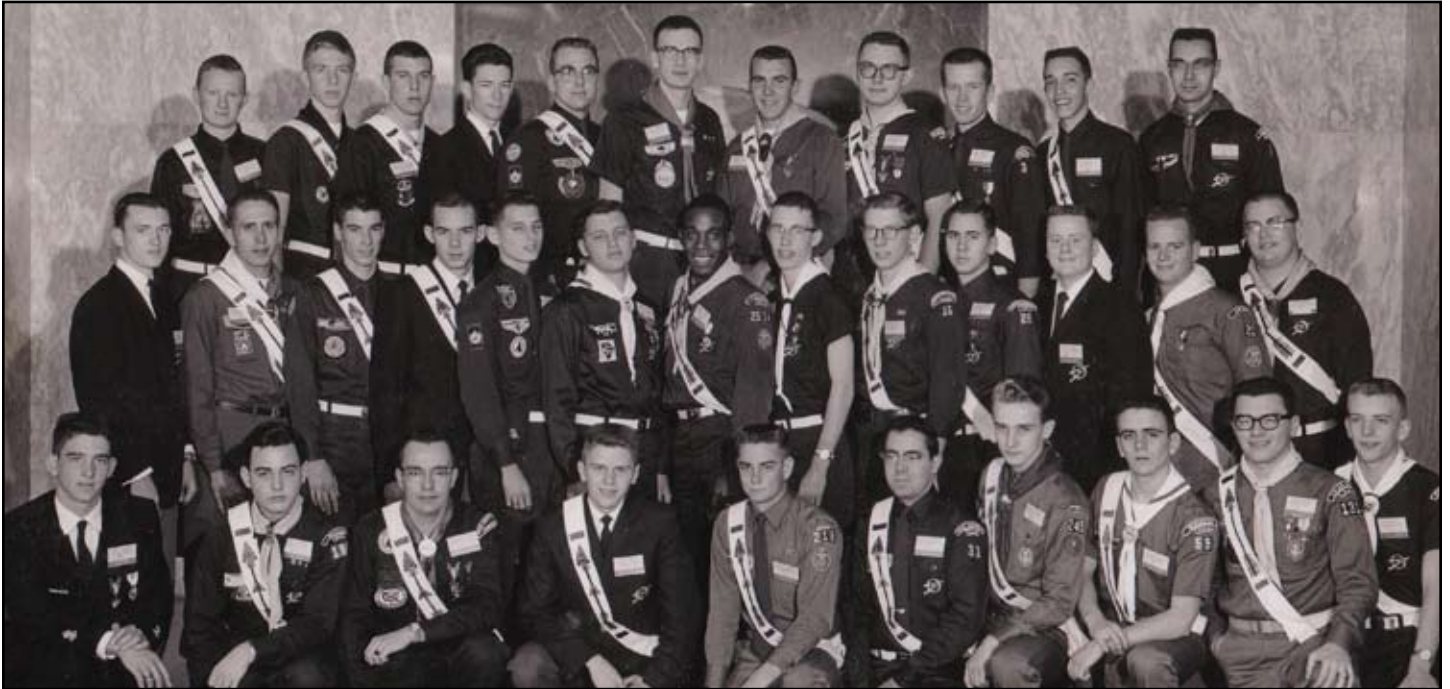
1961 National Conference Planning Committee.