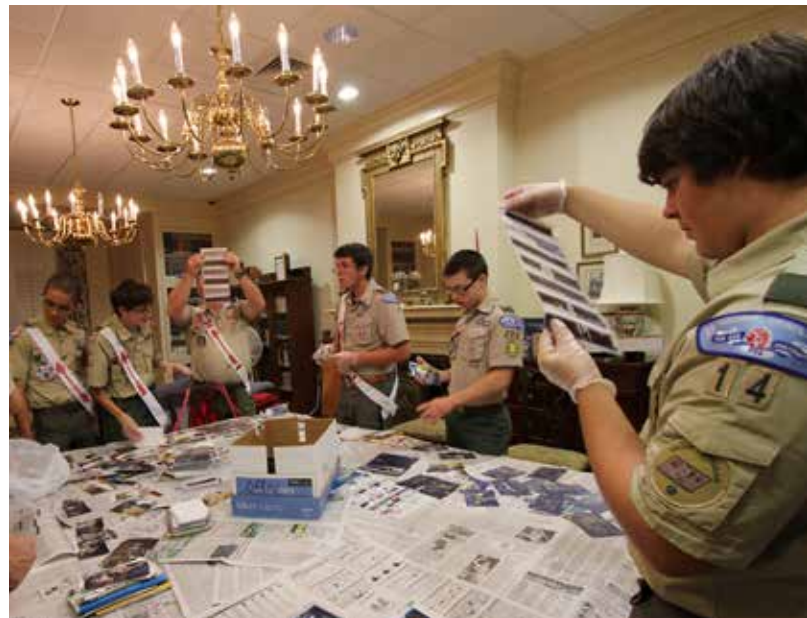
Sorting water-logged photographs to dry in the Local History Room at the Wayne County Public Library.

A secondary theme to consider is access. What is the point of saving old documents and photographs if no one can appreciate them? Scout history is important for our local communities as a positive legacy, which should be embraced. The NOAC museum proves this point. Unfortunately, over the years old Scouting documents have been discarded from council service centers or given to private collectors. However, another option that should be considered is the public library or an archive at an area college. A collection of local Scouting history at a reputable institution will remove the burden from a council service center and provide access to patrons.