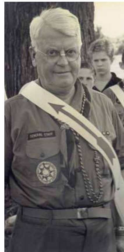
James E. West